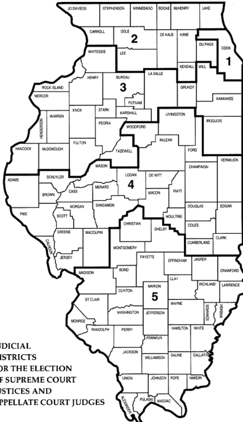
JUDICIAL DISTRICTS FOR THE ELECTION OF SUPREME COURT JUSTICES AND APPELLATE COURT JUDGES